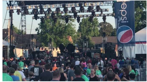
A scene from our community's annual Herrin Festa